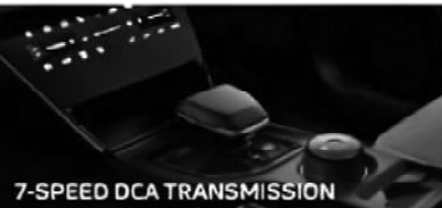
7-SPEED DCA TRANSMISSION

INDIA'S SAFEST SUV* | INDIA'S NO 1 SUV FOR THREE YEARS IN A ROW*