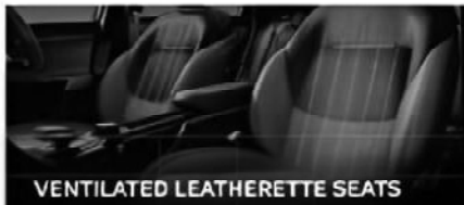
VENTILATED LEATHERETTE SEATS